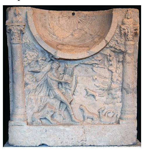
Image 6. Sundial with the image of Orpheus from Silistra, Bulgaria (Durostorum), 2<sup>nd</sup>-3<sup>rd</sup> century

Depictions of Orpheus did not appear in his homeland Thrace until the Greco-Roman syncretism of the 1^{st}-3^{rd} century, when the southern Danubian lands became Roman provinces. The most famous depiction from this period is from a sundial, dated 2^{nd}-3^{rd} century – an artifact without parallel in the Roman Empire.