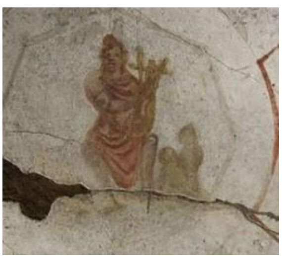
Image 3. Orpheus, St. Callixtus catacomb, Rome, early 3<sup>rd</sup> century

In the catacombs of Rome, we find frescoes depicting Orpheus, perhaps as the Good Shepherd Christ, which were, most probably, also used in a similar way for baptism, representing scenes of peace that evoke association with Christ (Jourdan, 2014: 125).