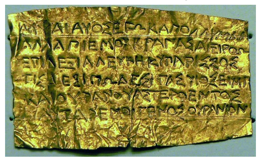
Image 2. Golden Orphic tablet from the second half of the 4th century BC, Thessaly

According to Prof. F. M. Müller<sup>12</sup> "Without faith in personal immortality, religion is like an arch laid on a single pillar or bridge ending in an abyss." Orphic literature teaches us what awaits us after death. The canonical texts written on the Orphic gold tablets serve as a guide for the soul in the afterlife. I will analyze some of them, entering the deep depths of eschatology, and, as expected, the interpretations of the texts are highly subjective, but not devoid of logic and consistency for the researcher of this and other similar teachings.