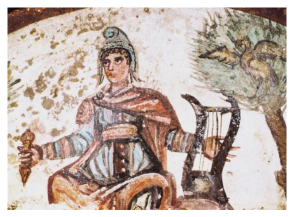
Image 4. Orpheus, St. Peter and Marcellinus catacombs, Rome, early 4th century